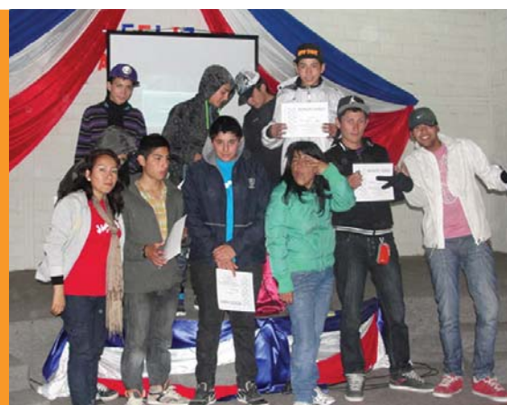
In Iquique, youths from the Alto Hospicio community center worked with peers.