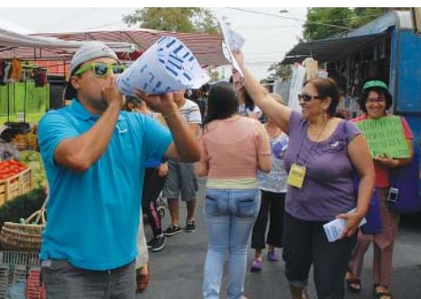
Participants in the 2012 training course take popular education to the local market.