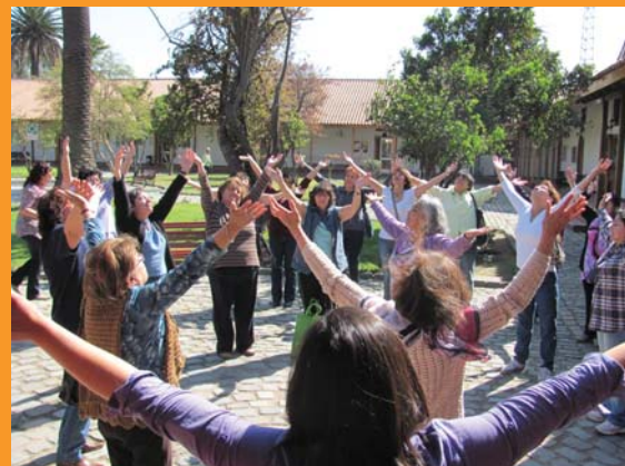
Above: In Santiago, the Chilean Women's Network Against Gender Violence conducted awareness workshops.