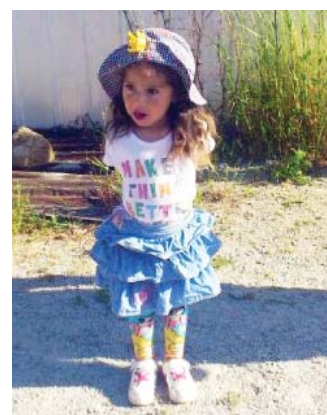
Visitors to the camps for earthquake victims met this young resident. Her t-shirt says it all: Make things better.