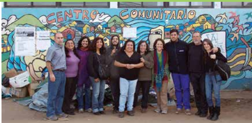
EPES staff members with volunteers from the Las Cañas Community Center after a day of working together at the center.