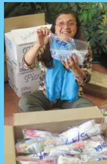
EPES staff and health promoters prepare emergency aid kits, for distribution at the Las Cañas Community Center to residents of Valparaíso devastated by the fire in April.